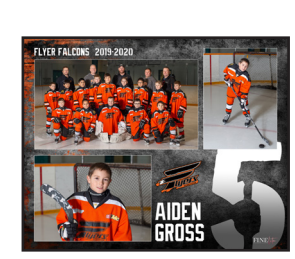
8x10 Number Collage